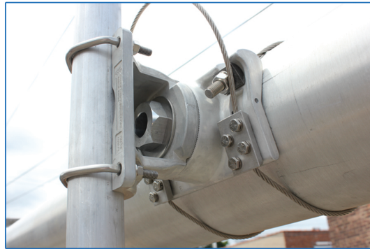
Rigid Mast Arm Clamp - Cable Type