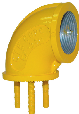
EF-240TS Studs are Stainless Steel