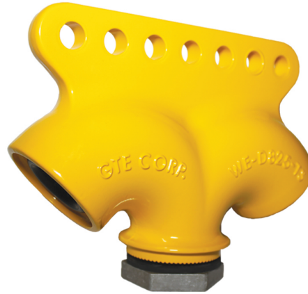
WE - D825 - T