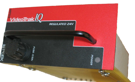
MPS4 VTIQ 24V Rack Power Card

The MPS4 Regulated Power Supply provides a consistent 24VDC to the card rack for the VideoTrak-IQ powered racks. This power supply card is included in the one and two detection cards racks with a slot for power.