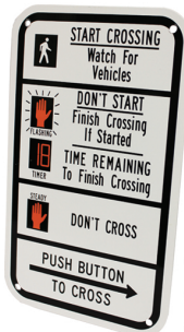
PS-915 9" X 15" Pedestrian Sign